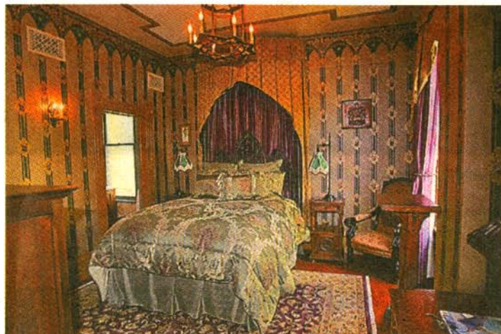
The 1887 Victorian is a romantic B&B two blocks from Balboa Park. Every guest room has a theme; this one is Gothic.

406 Maple St. Park West (619) 230-1991, www.brittscripps.com