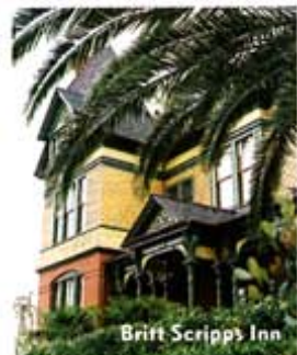
Britt Scripps Inn

Britt Scripps Inn. Elegant 1887 Queen Anne Victorian is perfectly situated for exploring Balboa Park. From $415. 406 Maple St.; www.brittscripps.com or 888/881-1991.